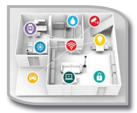
DESIGNED FOR LIVE ENVIRONMENTS

Detect and isolate problems that impact the quality of your wireless environments, exposing crowded networks & noisy interferences, including bluetooth, microwaves & more. Perfect for Initial Site Surveys to optimize channel & power settings.