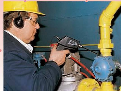
Ultraprobe 100 testing pump valve leaks

The Ultraprobe® 100 is a practical tool for any leak detection, steam trap inspection or mechanical troubleshooting program. Simple to use – find compressed air and steam leaks and prevent machinery failure with this unique instrument.