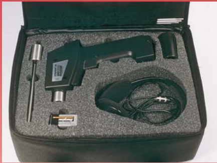
Ultraprobe® 100 KIT