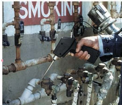
Tests steam traps