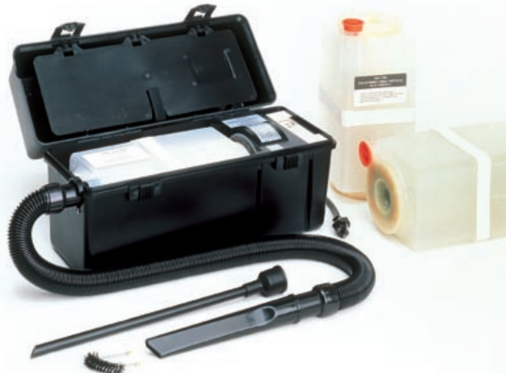
3M™ Electronics Vacuum, Model 497BF