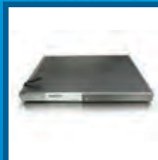
F045 Chemical Filter