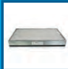
F022 Medical Grade HEPA