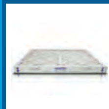
F265 Pleated Pre-filter