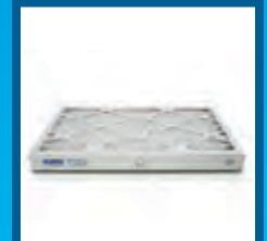
F007 Pleated Pre-filter