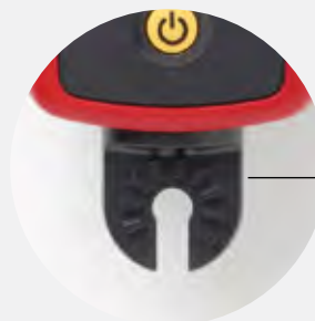
AT-8000-R universal attachment bracket for AT-410 Hot Stick attachment.