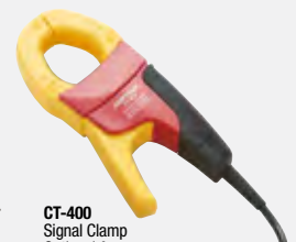
CT-400 Signal Clamp Optional Accessory