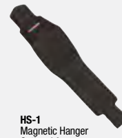
HS-1 Magnetic Hanger Optional Accessory