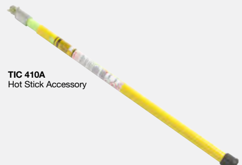
TIC 410A Hot Stick Accessory