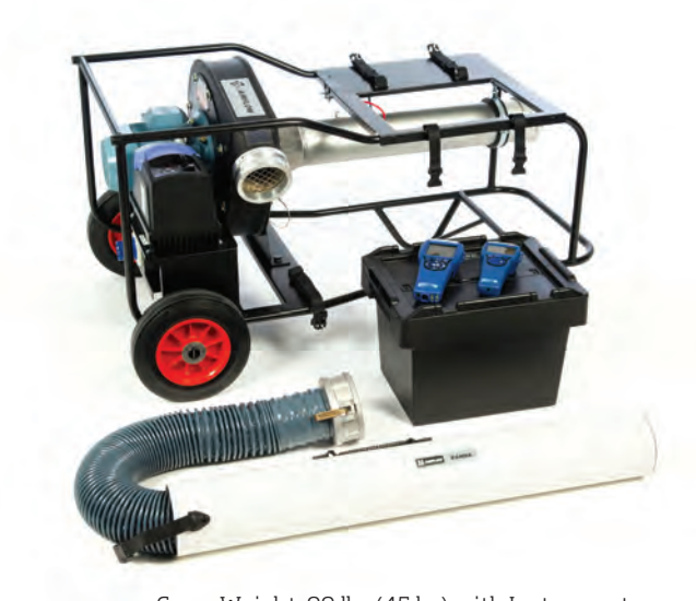
Carry Weight: 99 lbs (45 kg) with Instrument Box and Flex Carrying Tube Removed.