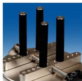
CT005 / CT006 / CT007 Extended length post sets

Complete set of brackets, cable, and hardware for calibration of any Series TT01 torque tester. Weights not available from Mark-10.