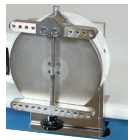
AC1036 Calibration kit

Rubber-edged arms may be independently repositioned to accommodate unique samples.