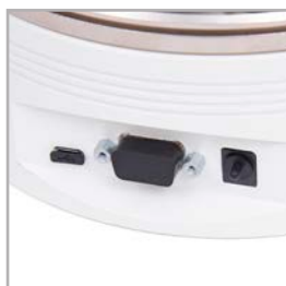
AC1077 Connector cover kit

CT005: Four 2.5" (63 mm) posts CT006: Four 4" (101 mm) posts CT007: Kit of four of each length: 1.25" (31 mm), 2.5" (63 mm), and 4" (101 mm)