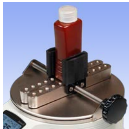
CT001 Flat jaws

Set of rubber jaws for gripping square or odd shaped containers.