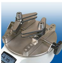
CT003 Adjustable jaws

Provides storage space for the TT01 tester, gripping jaws, AC adapter, and accessories.