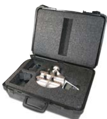
CT002 Carrying case

Set of rubber jaws for gripping square or odd shaped containers.