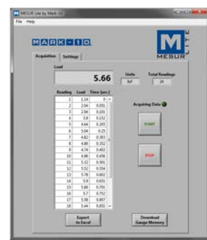
MESUR Lite data acquisition software is included with Series TT01 testers

Series TT01 testers include MESUR™ Lite data acquisition software. MESUR™ Lite tabulates continuous or single point data. Data stored in the TT01's memory can also be downloaded in bulk. One-click export to Excel allows for further data manipulation.