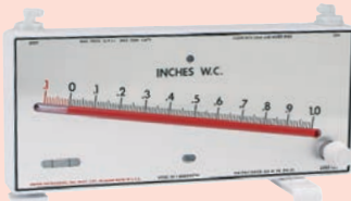
Mark II Model No. 40-1 inclined manometer