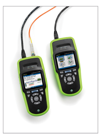
Left: LRAT-2000 / Right: LRAT-1000