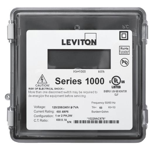
Outdoor NEMA 4X Enclosure