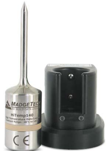
IFC400 (sold separately)

Using the MadgeTech Software, starting, stopping and downloading the HiTemp140 is simple and easy. To use, simply place the HiTemp140 in the IFC400 or IFC406 docking station (sold separately). Using the software, an immediate or delay start can be chosen, as well as the reading rate. Start the data logger, remove it from the docking station and the device is ready to be deployed. Graphical, tabular and summary data is provided for analysis and data can be viewed in °C, °F, K or °R. The data can also be automatically exported to Excel® for further calculations.