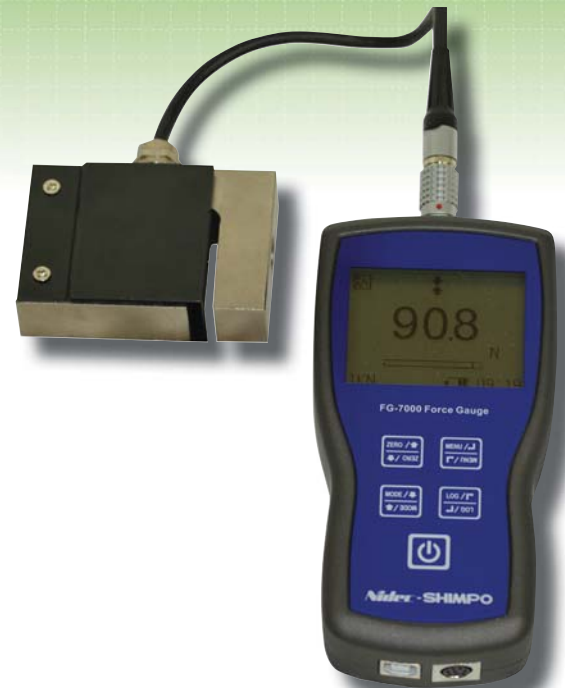
FG-7000L with Connected Load Cell