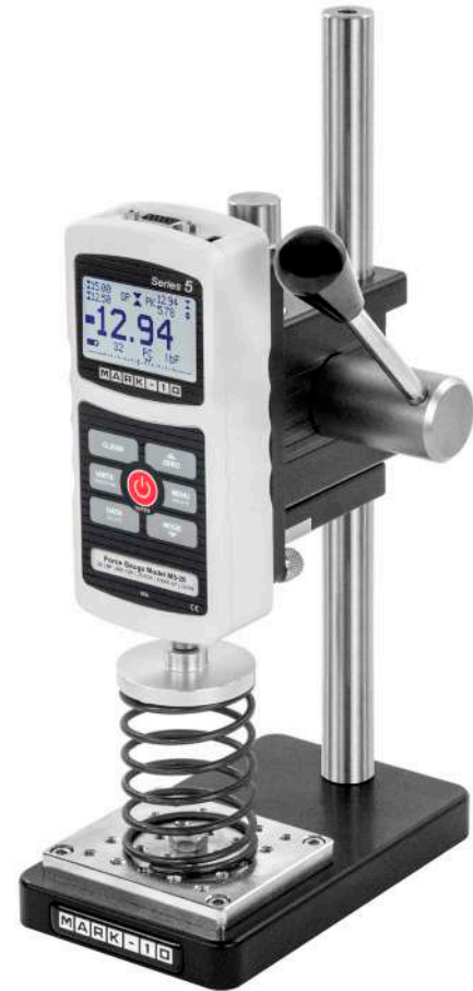
The ES05 is shown in a spring compression test, with Series 5 digital force gauge and 2" compression plate

Base plate AC1060 Contains 25 #10-32 threaded holes for fixture mounting