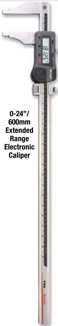
0-24"/ 600mm Extended Range Electronic Caliper