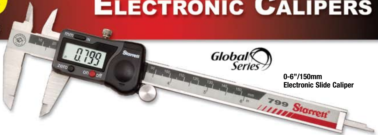
0-6"/150mm Electronic Slide Caliper

Starrett's 799 Series Electronic Calipers are light, comfortable, easy-to-use, and include features that have made Starrett Slide Calipers the machinist's first choice for many years.