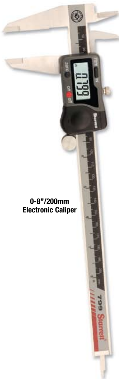
0-8"/200mm Electronic Caliper