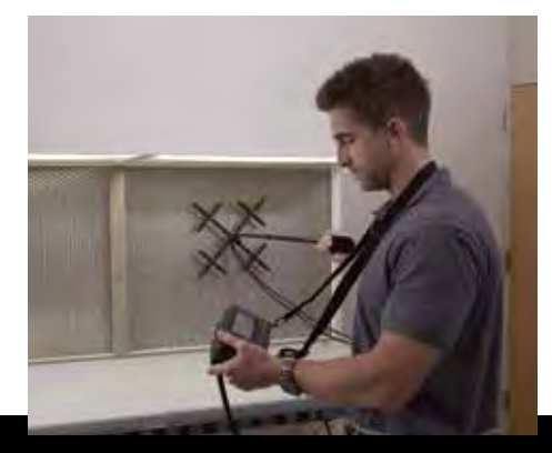
Plug and play thermoanemometer probes enables use in multiple applications.