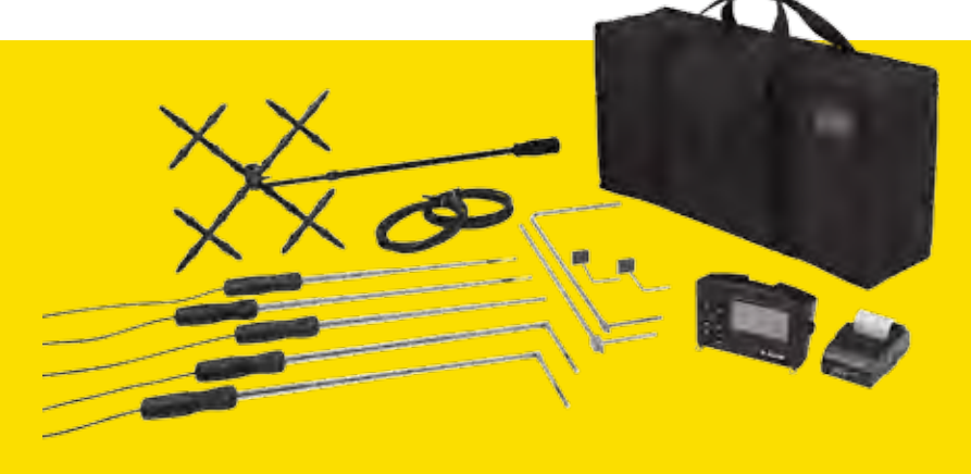
Model EBT730 (Micromanometer shown with standard and optional accessories)

As standard, the EBT731 Balometer Capture Hood includes a detachable EBT730 micromanometer—one of the most advanced, versatile, and easy to use micromanometers on the market today. The EBT730 features an auto-zeroing pressure sensor that increases measurement resolution and accuracy as well as integrates an intuitive menu structure to facilitate simple operation.