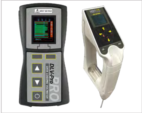
DLV-Pro Voltmeter & SG-Ultra Digital Hydrometer