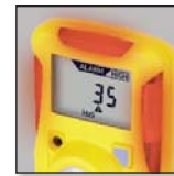
Easy to See