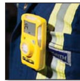
Easy To Wear