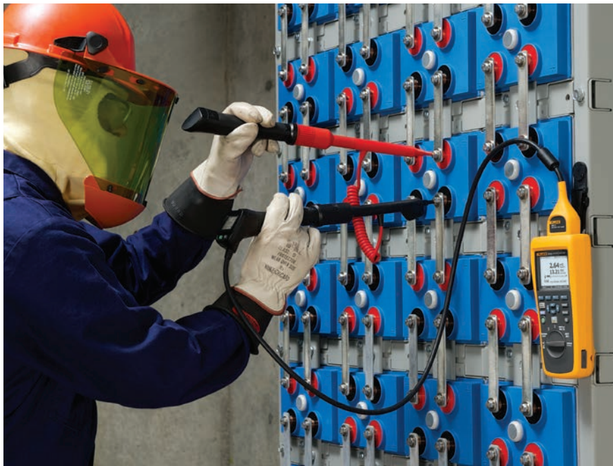
Measuring ohmic values in sequence mode

AC ripple current: residual ac on the rectified voltage in dc charging and inverter circuits.