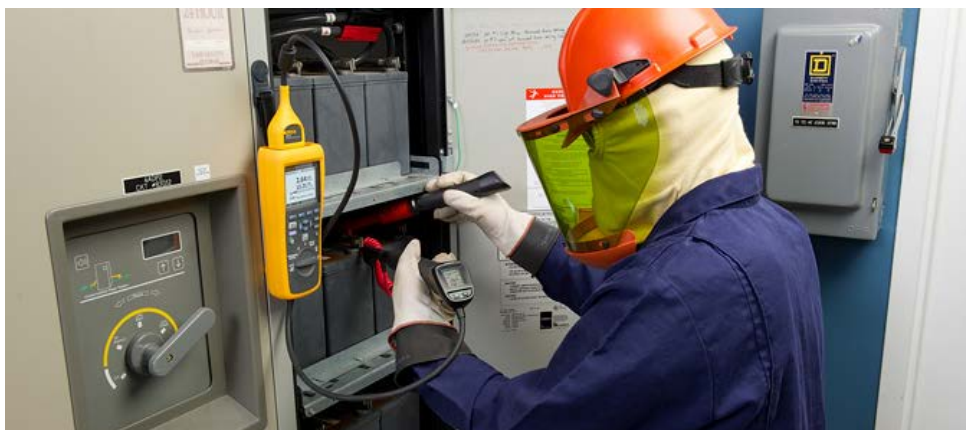
Using the Fluke BT52X to measure impedance, for the quarterly cell/unit internal ohmic value test.