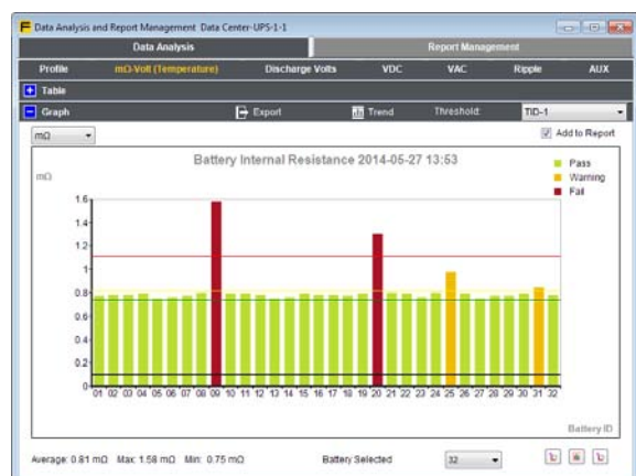
Histogram of a battery string with user defined threshold.