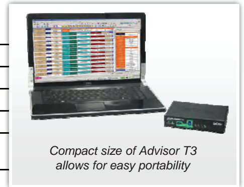
Compact size of Advisor T3 allows for easy portability