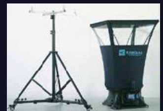
Portable stand: extends up to 6.9' from top to base