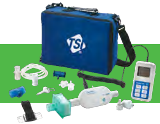
4070 High-flow test system with 4073 Oxygen sensor kit (sold separately)

TSI and the TSI Logo are registered trademarks of TSI Incorporated.