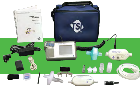
4080 High-flow test system with 4082 Low-flow kit (sold separately)