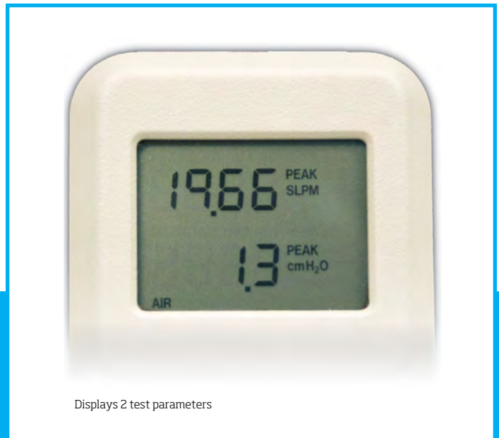
Displays 2 test parameters