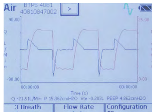
Graph up to 2 test parameters