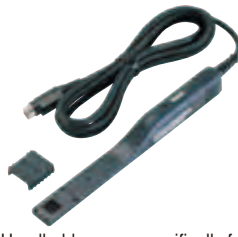
Handheld sensor specifically for blue-violet optical lasers