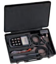
Handy for travel and storage

Optical Power Meters installed with firmware version 1.01 or earlier must be updated to support compatibility with the new Optical Sensor 9743/ 9743-10