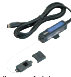
Sensor specifically for blue-violet optical lasers (detachable model)