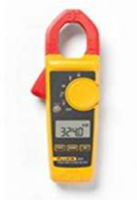
Fluke 324 True-RMS Clamp Meter