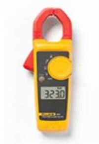
Fluke 323 True-RMS Clamp Meter