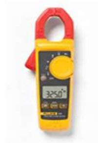
Fluke 325 True-RMS Clamp Meter