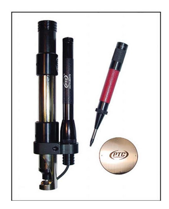
Model 316 shown above