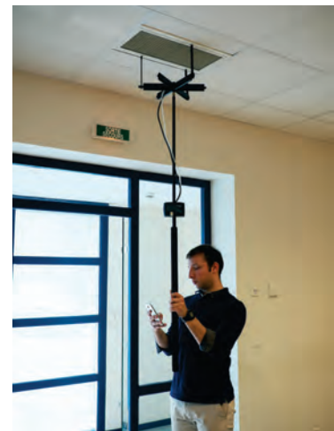
Use with the measurement grid