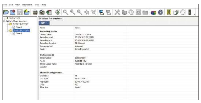
Current configuration of a logger