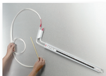
1227 mounted in incline position