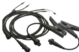
+ KC1 Kelvin clip 3 m leads