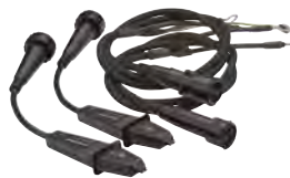
+ DH4-C probe 1.5 m leads