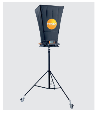
Sturdy, wheeled tripod (optional) with central fitting for safe measuring of high ceiling outlets.