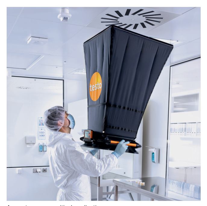
Accurate even on critical applications