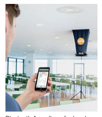
Bluetooth App allows for hands free operation, displaying measurement data on mobile devices and finalizing the measurement report on site.