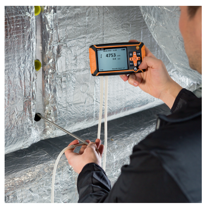
Removable instrument allows Pitot tube measurements in ducts (Pitot tube optional)