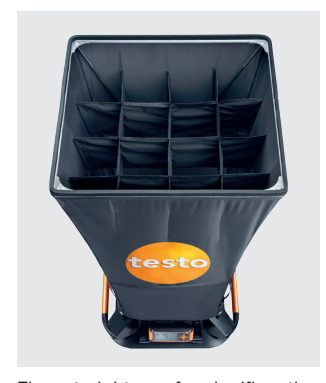
Flow straightener for significantly more precise measurements at turbulent outlets.