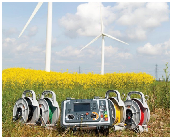
Figure 4: Ground resistance tester with test leads

Busbar, cable joints, and high-voltage circuit breakers in or near the tower need testing to eliminate potential hazards caused by induced voltages. Contact resistance testing of circuit breakers is a crucial safety test, and poor contact resistance leads to poor circuit breaker performance can lead to electrical damage. Circuit breakers are vital safety devices that ensure disconnection in the event of a fault. Therefore, in locations where the power supply is limited, a high-current micro-ohmmeter is best for it can conduct a full day's worth of testing.