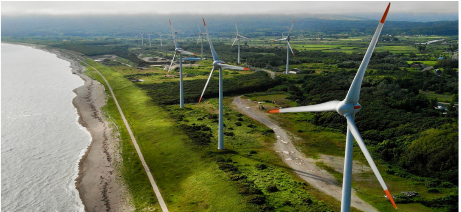
Figure 1: Wind turbines in action on the coast

Ensure your wind power systems are properly and reliably maintained to protect them from lightning strikes