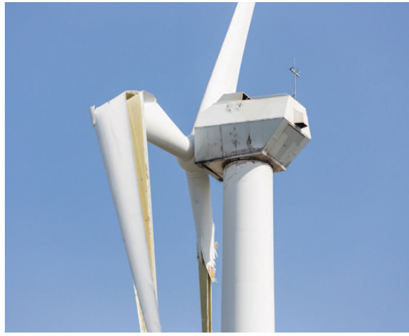
Figures 2a and 2b: Damage from lightning strikes on wind turbines